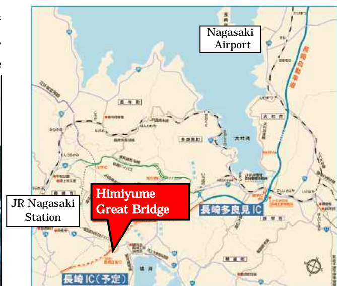
Fig.-1: The location of the Himiyume Great Bridge

The author had opportunities to visit this bridge under construction three times and learned about the technological characteristics in terms of the design and construction of this bridge in relationship to the surrounding environment. Here follows the introduction.