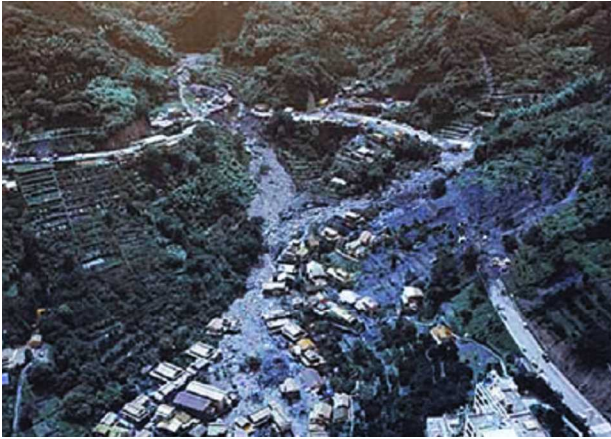
Photo-2: The Susukizuka Area at the time of the Nagasaki Great Flood in 1982