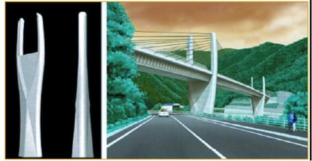
Fig.-2: The image of the bridge piers and the main tower

Also, there were the strict construction conditions, such as very steep terrain and an approach path to the bridge pier building spot that was restricted only through the national road, so the work on the national road had to be