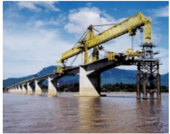
(Cover Photo - Pakse bridge in Laos)

The people in Laos call the bridge Lao-Nippon Bridge since the construction was fully supported by the Japanese government as Grant Aid. Not only the money, but also the technology. Although the bridge was planned, designed and constructed by Japanese organizations and companies, the Japanese engineers eagerly tried to transfer their technology to the Lao engineers. The construction sites were much more international; the engineers from more than ten countries gathered and cooperated. The completed bridge is expected to make the surrounding countries more prosperous. However, the project itself has contributed a lot to international exchange of civil engineering technology and mutual understanding and friendship of the people involved.