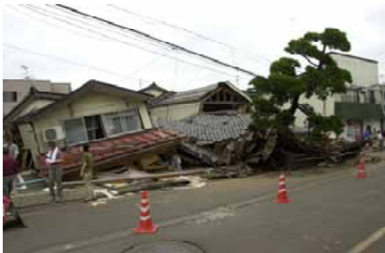
Collapsed wooden houses in Kashiwazaki city

The quake caused the loss of 11 lives and injured about 2,000 people. About 1,100 houses and building was subjected to heavy damage, and about 3,800 houses and buildings were moderately damaged in Niigata prefecture. Collapses occurred almost exclusively to old houses built of wood and clay walls and heavy kawara (clay-tile roof).