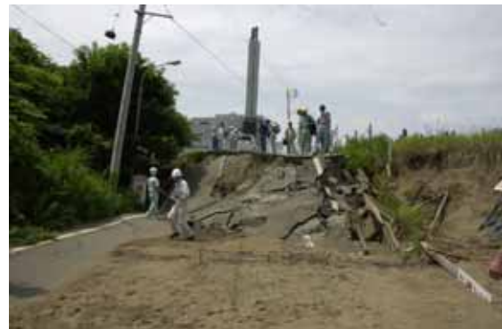
Lateral spread on road to Kashiwazaki Municipal Incinerator

The lifeline utilities of gas, water and electricity were also damaged. Power outage occurred at about 35,400 households right after the quake, but the services were recovered within a day in most of the epicentral areas. The water and supply systems were also damaged. The water suspension occurred at about 61,500 households and stop of gas supply at 35,150 households. The recovery from water suspension was on August 4th and recovery of gas stop on August 27th.