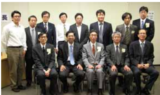
Lecturers and organizers

The seminar, following the 1st KSCE-JSCE Joint Seminar on Hybrid Structures held in Gwangju, Korea on October 13, 2006, was organized as an international event of the 7th JSCE Symposium on Research and Application of Hybrid Structures. The objective was to understand updated situations of each country in the field of research and practical applications on hybrid structures of steel-concrete, FRP-concrete and other connections of concrete with different materials.