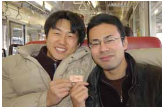
On the way to Yamadera temple in Yamagata prefecture using a JR Senzan line

I do hope that South Korea will have some merits from Japanese experiences and technology in order to modernize the transportation networks in South Korea in the near future.