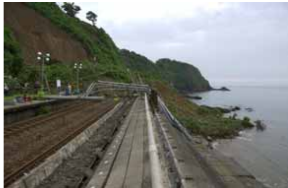
Landslide at Oumigawa Railway Station

railways. Landslide at the Oumigawa Train Station on the Shin-etsu Line, located at the south of Kashiwazaki city, was one of the largest landslides. Lateral spreading, liquefaction, and slope failures also occurred extensively. A zone of lateral spreading, sand boils and settlements adjacent to Sabaishi River was associated with a buried sand deposit of a former channel. A failure of a road occurred on the north of the river adjacent to the Kashiwazaki Municipal Incinerator.