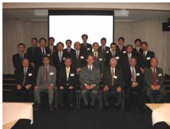
ICE & JSCE members at the party