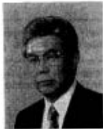
Shigeyoshi NAGATAKI Chairman of JSCE Research Subcommittee

JSCE Research Working Group on Durability Design for Concrete Structures under Subcommittee on Standard Specification for Design and Construction of Concrete Structures