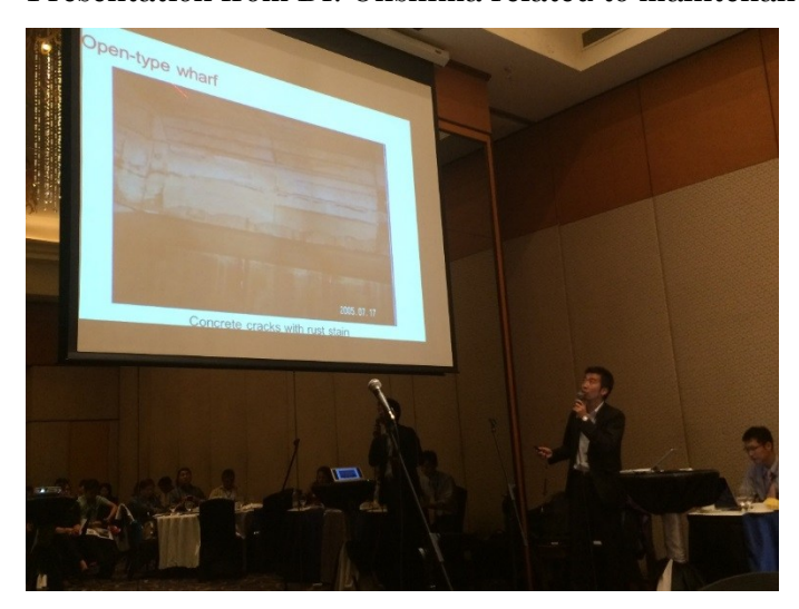
Presentation from Dr. Yamaji related to maintenance of port structures