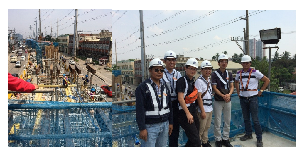
Visit to Skyway Construction site.