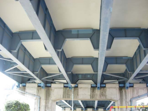
Fig. 2. Bottom-surface overlaying method