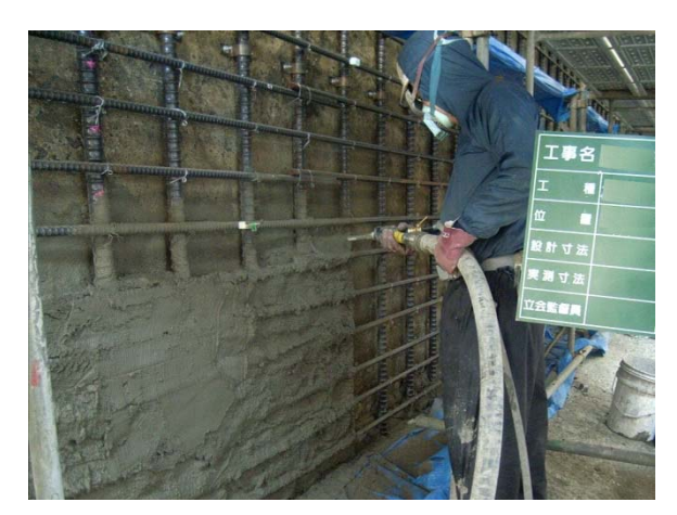
Fig. 3. Concrete jacketing method