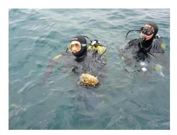
Sample from Baia

condition, although their performances are same at the initial stage.