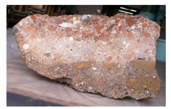
Cut Sample from Somma