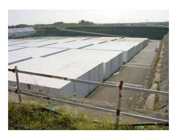
Huge concrete structures for storage of nuclear waste in Aomori, Japan